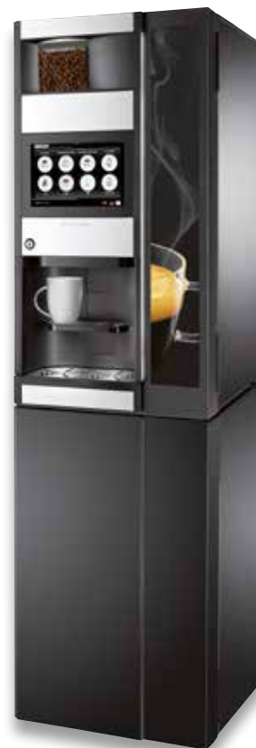
The elegant base stand enhances the design of the machine.

• not all accessories are available in the UK